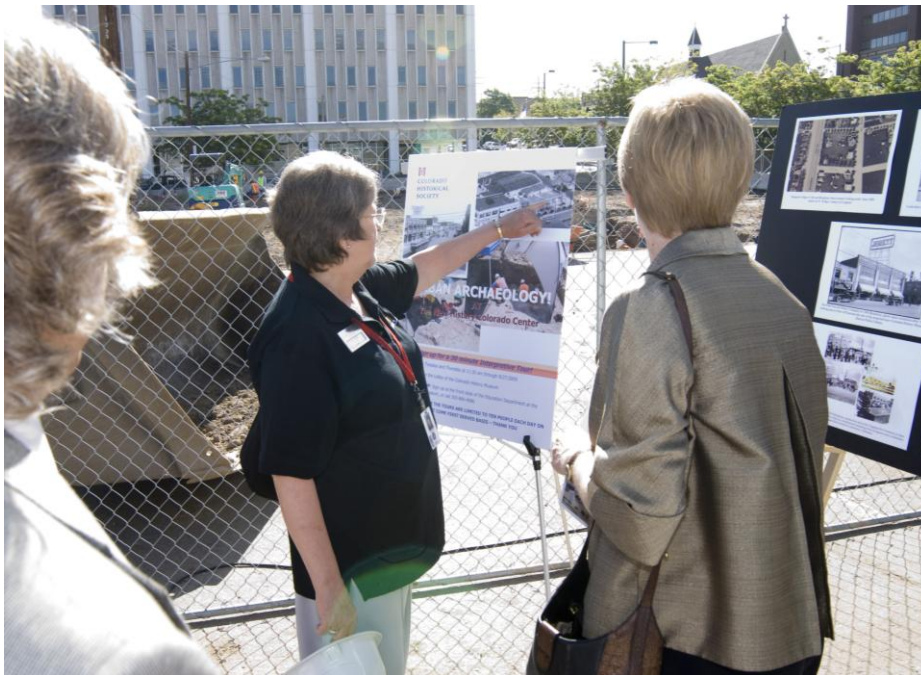
Susan Collins at the History Colorado Center ground breaking ceremony

“I must admit that I personally measure success in terms of the contributions an individual makes to her or his fellow human beings” ~ Margaret Mead