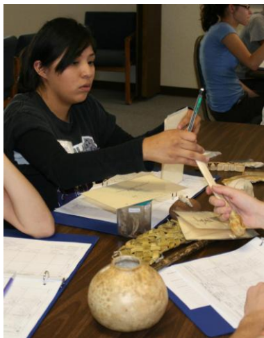
Skye learns the timeline of Ancestral Puebloan archaeology through the "Windows into the Past" curriculum