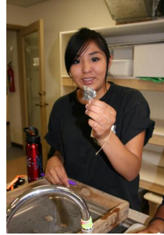
Skye discovers ancient pottery while cleaning artifacts in the laboratory