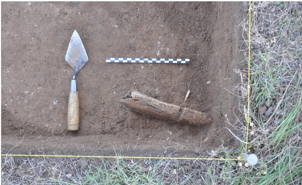
Figure 2. Mammoth rib in situ in late Pleistocene loess.